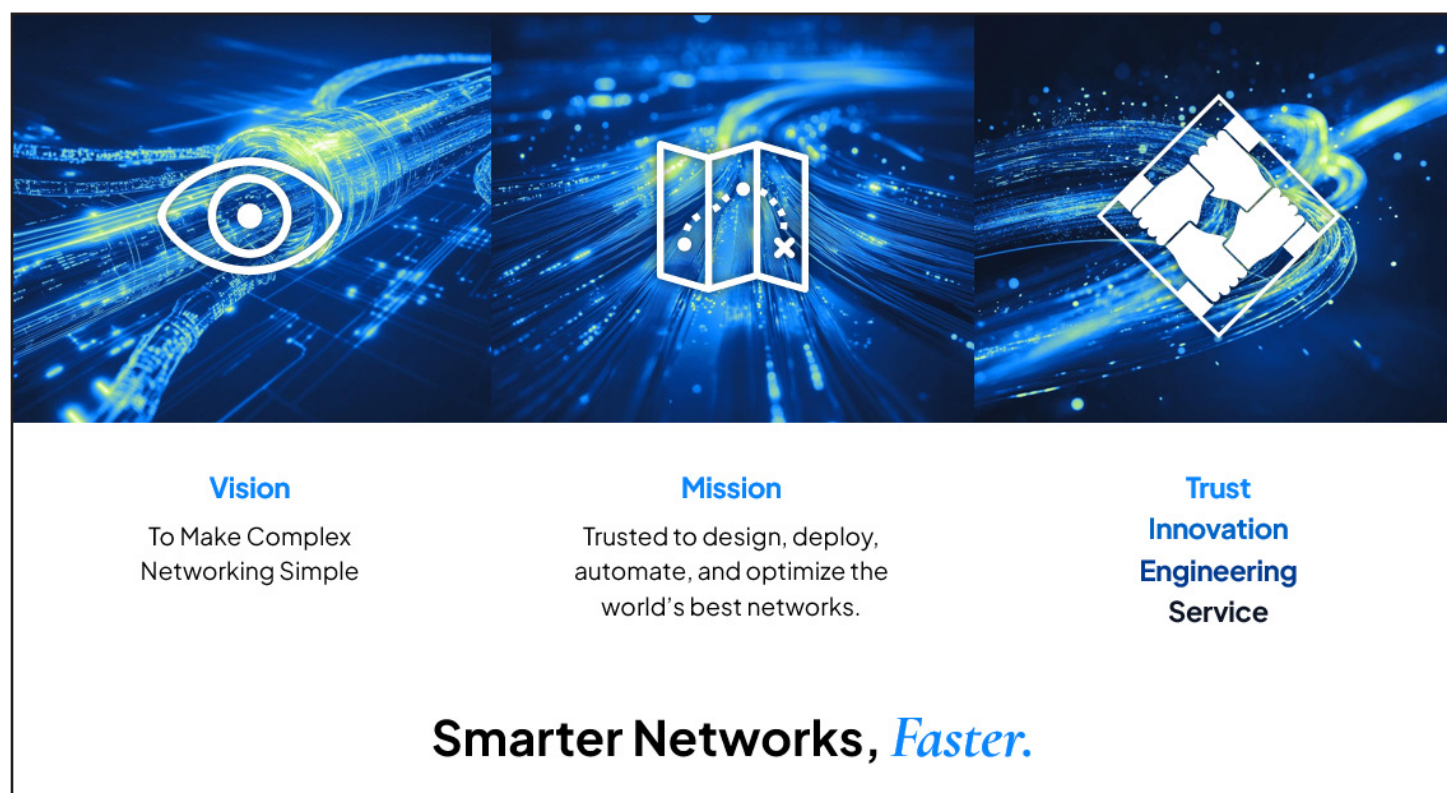
Figure 1 - Lightriver's Vision and TIES Methodology

LightRiver's NetFLEX product jumpstarts network optimization with automatic network discovery that combines network inventory data with live network information by communicating directly with network devices in their native language. LightRiver's For LightRiver, this begins by recruiting and retaining the