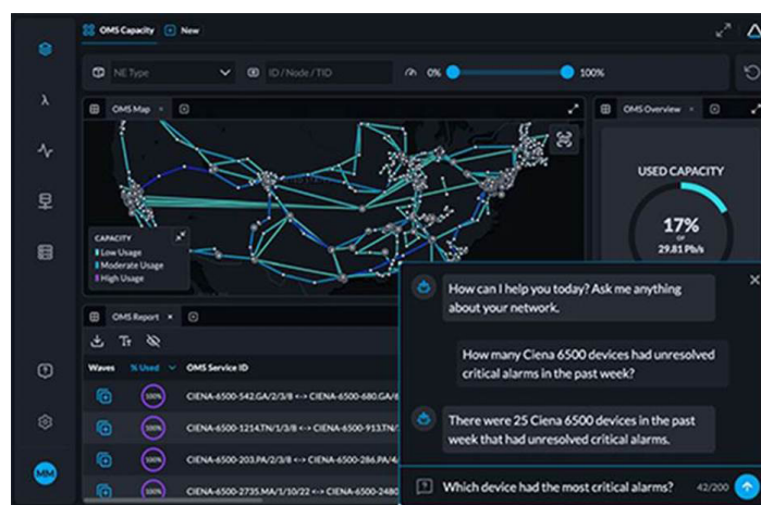
Figure 2 - Click to Enlarge

the combined data to drive network efficiency in numerous ways such as for identifying hidden spares and underutilized equipment; stranded assets that can be re-purposed, decommissioned or resold; excess bandwidth; circuits that customers may be paying for but no longer need; or assets that might be easier to groom into a more manageable footprint. Think of nIO as an AI optimization engine that knows everything about your network, and all you have to do is ask.