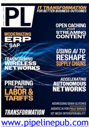
Volume 21, Issue 6