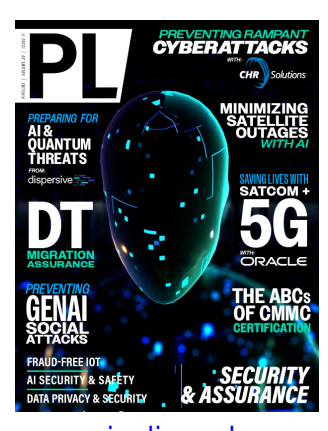
www.pipelinepub.com Volume 21, Issue 1