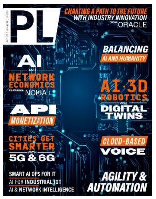
www.pipelinepub.com Volume 20, Issue 10