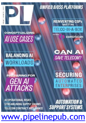
Volume 20, Issue 7