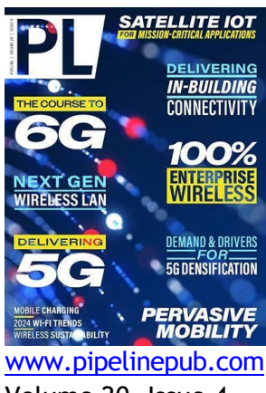
Volume 20, Issue 4