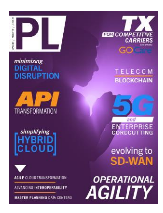
www.pipelinepub.com Volume 19, Issue 10