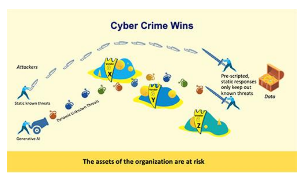
Illustration #1: Advantage of Generative Al Created Attacks

sieve and if any come through, it is recognized as an attack. For each type of attack that has been found and analyzed, a sieve is created and data is poured through all the sieves one after the other. When a new type of attack appears, it is not immediately recognized. But when the damage becomes obvious, professionals analyze it and create a sieve.