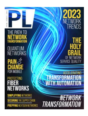
www.pipelinepub.com Volume 19, Issue 3