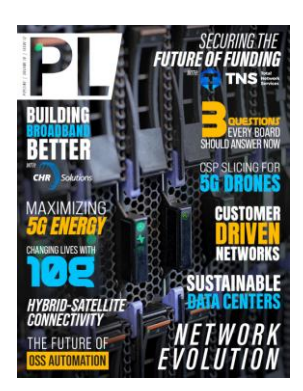
www.pipelinepub.com Volume 18, Issue 12