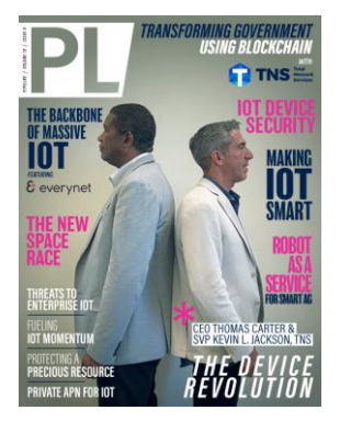
www.pipelinepub.com Volume 18, Issue 9