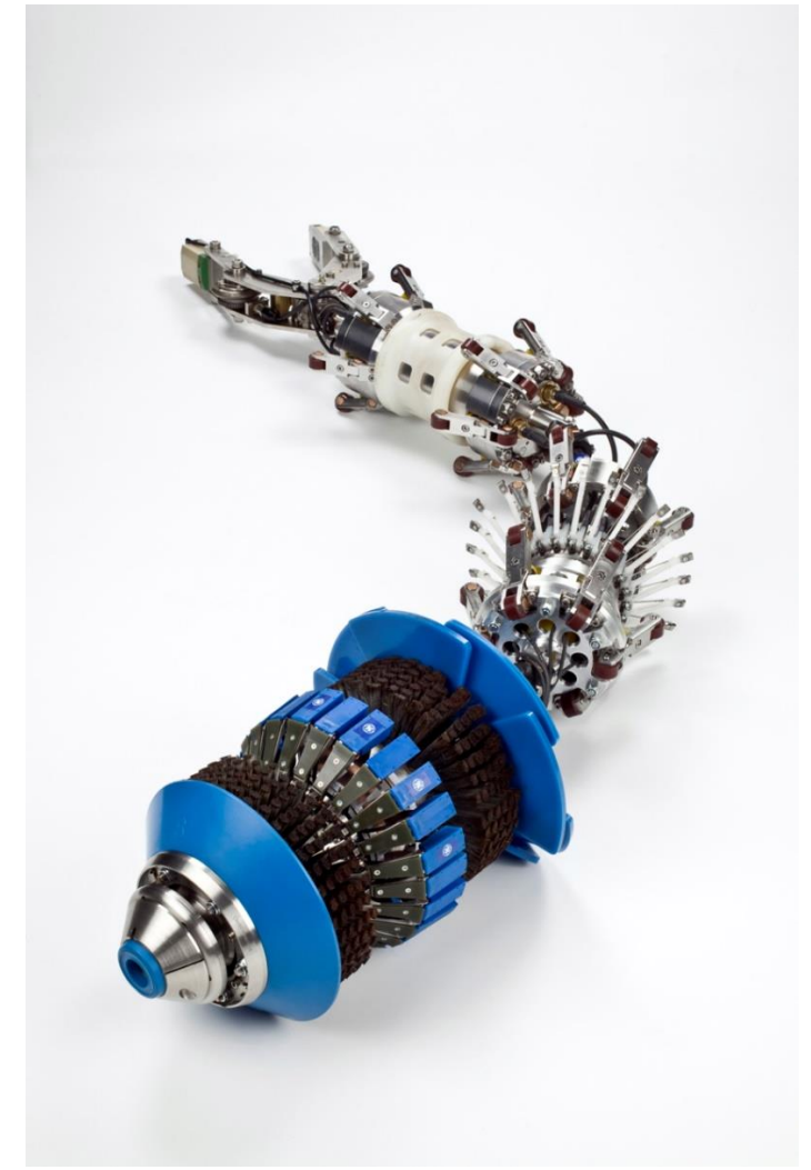
Figure 2: MFL Vehicle

Ultrasonic Wall Measurement measures the remaining wall thickness of the pipe and can be used in finite element calculations to determine the remaining strength. This technique is more costly but provides a highly accurate survey of corrosion and will also identify and size laminations as well as dents. However, line cleanliness can become an issue for ultrasonic technologies.