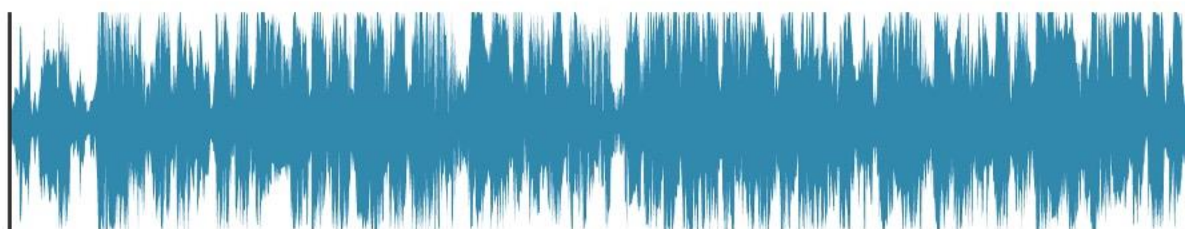
Black Magic Woman - Santana

Below are a few examples of performance results from Aira Technologies. Consider music playing on a phone and streaming to your Bluetooth earbud or headset. Figure 1 below shows a representation of the Bluetooth audio across a few seconds when wireless link quality is good.