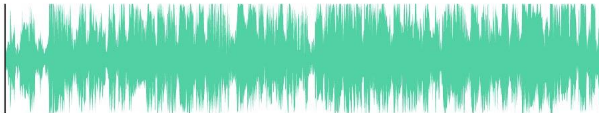
Black Magic Woman - Santana

Using machine learning, even the poor reception that is shown in Figure 3 can be corrected to deliver clean music audio. Figure 4 shows a real-world example of how the audio looks after ML-based corrections.