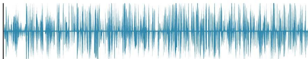
Black Magic Woman - Santana

To understand a simple example of how ML has been harnessed to achieve such impressive results, it's important to understand that wireless communication channels are inherently noisy and as a result, a large percentage of packets that are transmitted arrive with errors. Figure 2 shows a representation of the same Bluetooth audio stream when about half the packets are being lost.