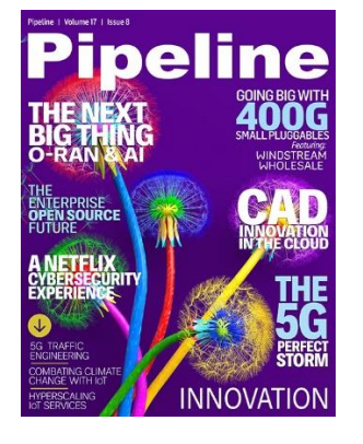
www.pipelinepub.com Volume 17, Issue 8