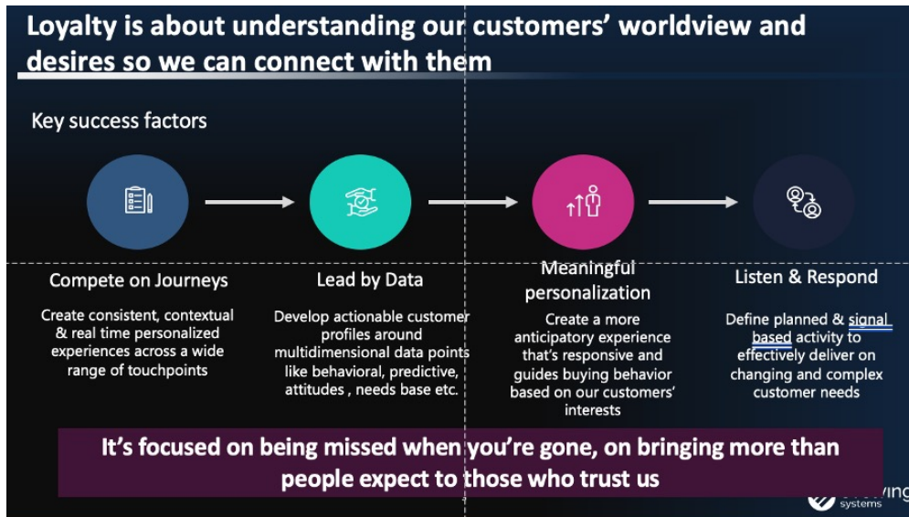
Figure 1: Holistic Loyalty Building click to enlarge