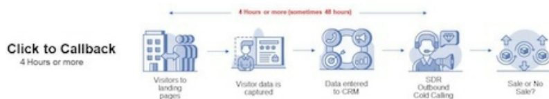
Figure 2: Click-to-Call Back call flow

Click-to-call Back (Figure 2, below) is a widget that will allow the customer to leave their phone number with your call center. The call center then calls the prospective customer back.